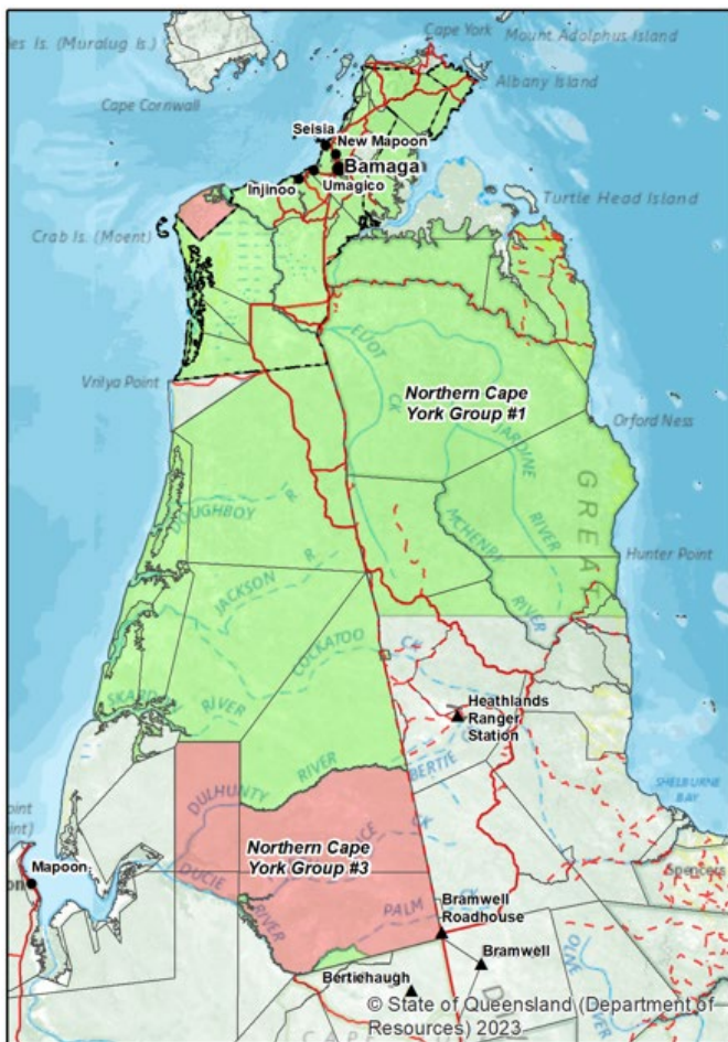
Map 1 - NCY #1 Determination area (shaded green)

With assistance from its legal representative in this matter, Ipima Ikaya Aboriginal Corporation RNTBC (IIAC) will hold a consultation and consent meeting on Tuesday 16 July 2024 in Injinoo with members of the Northern Cape York #1 (NCY#1) Native Title Claim Group about a proposed Indigenous land use agreement (ILUA) between IIAC and the Northern Peninsula Area Regional Council (NPARC). The proposed ILUA will relate to the whole NCY#1 native title determination area (as shown in Map 1 below). The proposed ILUA, if approved by native title holders, will permit the use and/or expansion of existing gravel pits (mostly as shown by green dots on the Map 2 below) and, if native title holders agree in future for a particular area at a publicly notified consultation and consent meeting, new areas as well.